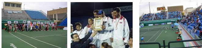
6 th African Nations' Cup Tunis- 2005.

All necessary information and entry forms will be sent to African National Associations affiliated to CAT in August 2006.