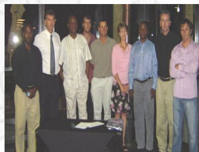
4 th African Coaches Conference Pretoria 2004 All Experts