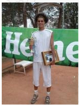
C LG LG LG C LG LG