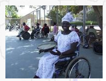
Female Player from Gambia