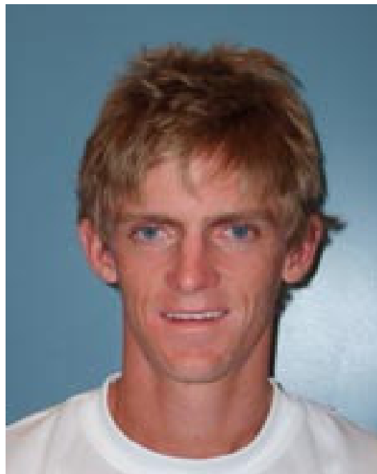
Kevin Anderson (RSA)