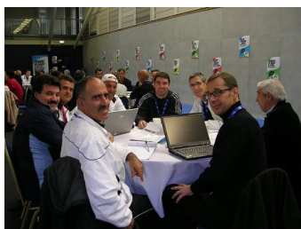
Discussion of the French speakers