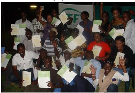
Participants getting their Certificates of attendance