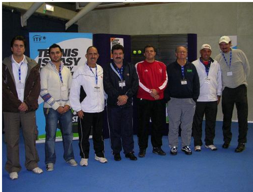
Africans whose attended the Seminar