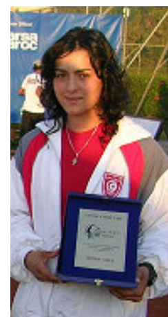
Ons Jabeur (TUN)