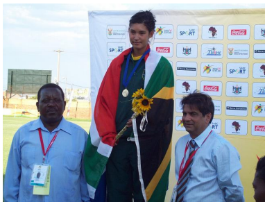
Women's Single Laureate