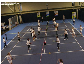
On Court Session