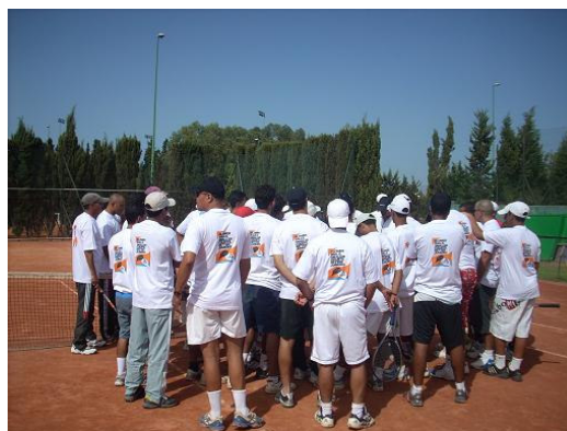
On Court Session