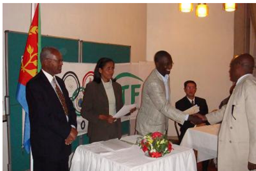
President of the ETF presenting Certificates