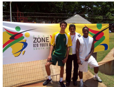
The 2 Men's Finalists