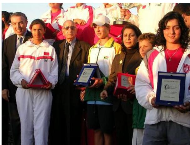
All Laureates around Madam the Minister