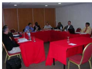
CAT Ex. Committee Meeting