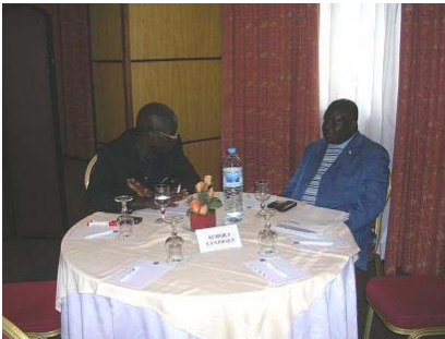
Zone III – Central Africa