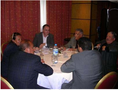
Zone I – North Africa

Photos of the Zones' meeting – 16 April 2009