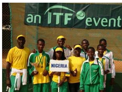
Nigeria Team – Winner