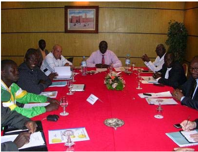
Zone II – West Africa