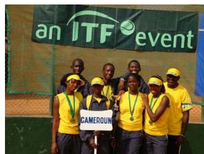
Cameroon Team – Runner Up