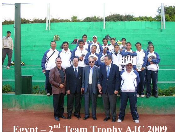
Egypt – 2 nd Team Trophy AJC 2009

The team trophy was awarded to the nation who accumulated the highest number of points based on the best four singles results and the best four individual doubles results of each team. South Africa finished in first place, ahead of Egypt, Tunisia and Morocco. South Africa also won the boys' team trophy, while Tunisia won the girls' team trophy.