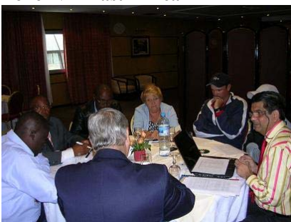
Zone V – Southern Africa