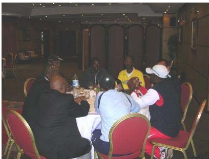
Zone IV – East Africa