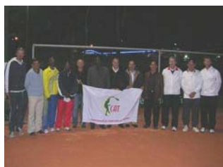
CAT Development Committee