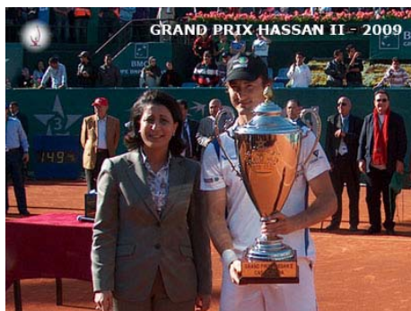
Mrs. El Moutawakel & J.C. Ferrero