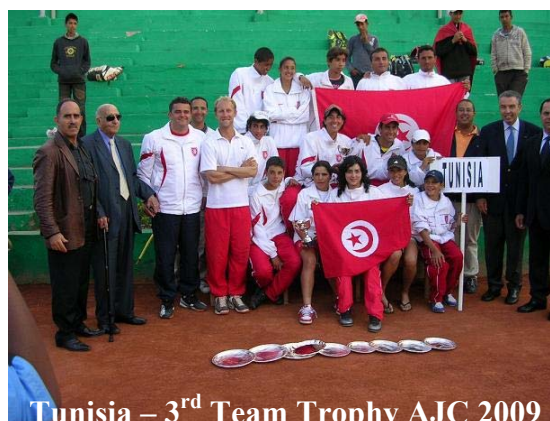
Tunisia – 3 rd Team Trophy AJC 2009