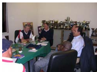
Dev. Co. Meeting