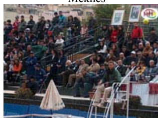
Public in Meknes