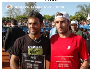
Rabat – Winners