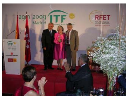
ITF Award 2009