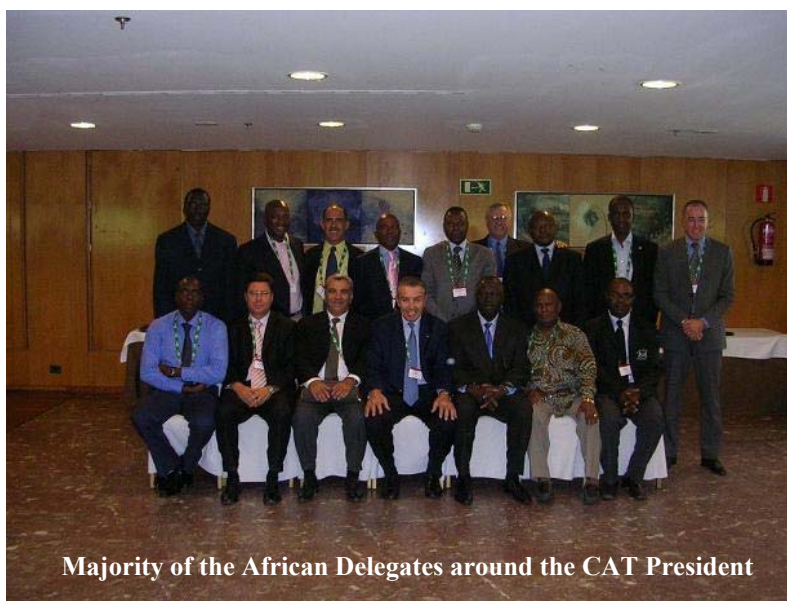
Majority of the African Delegates around the CAT President

* Finance situation of CAT and Affiliation & membership of African National Associations.