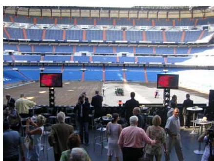
The Bernabeu – FRET Cocktail