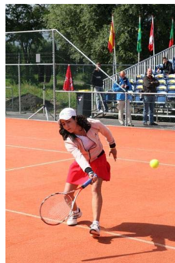
Ons Jabeur (TUN)