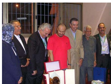
Photo souvenir with Dr Gaddafi