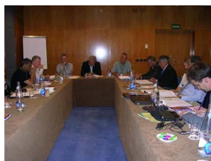
Regional Associations' Meeting