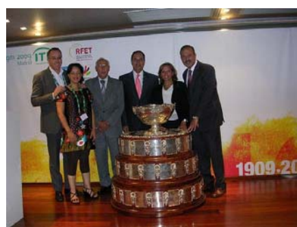
African Delegates & Partners