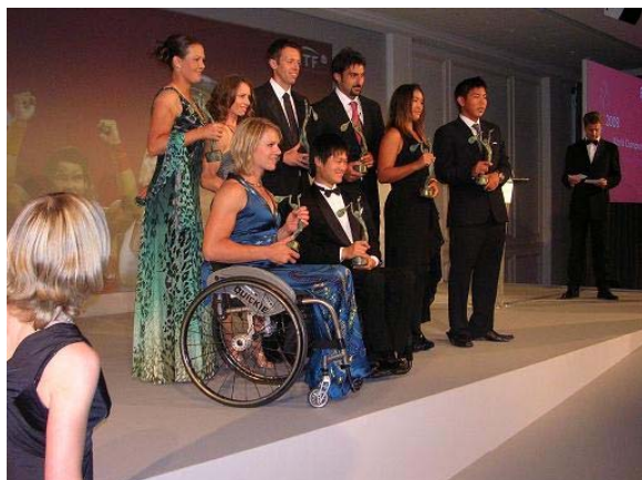
All Laureates 2008