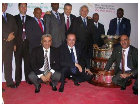
Africans around the Davis Cup Trophy