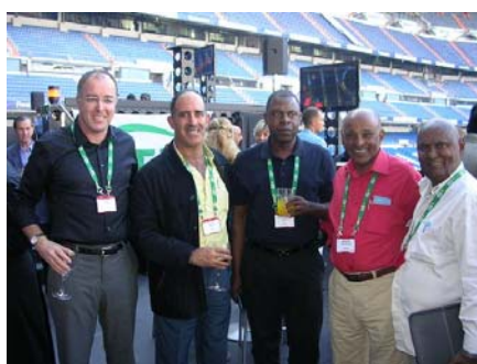
African Delegates at the Bernabeu - Madrid