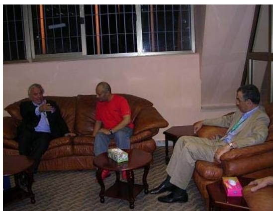
Meeting of Dr Gaddafi with ITF & CAT Presidents