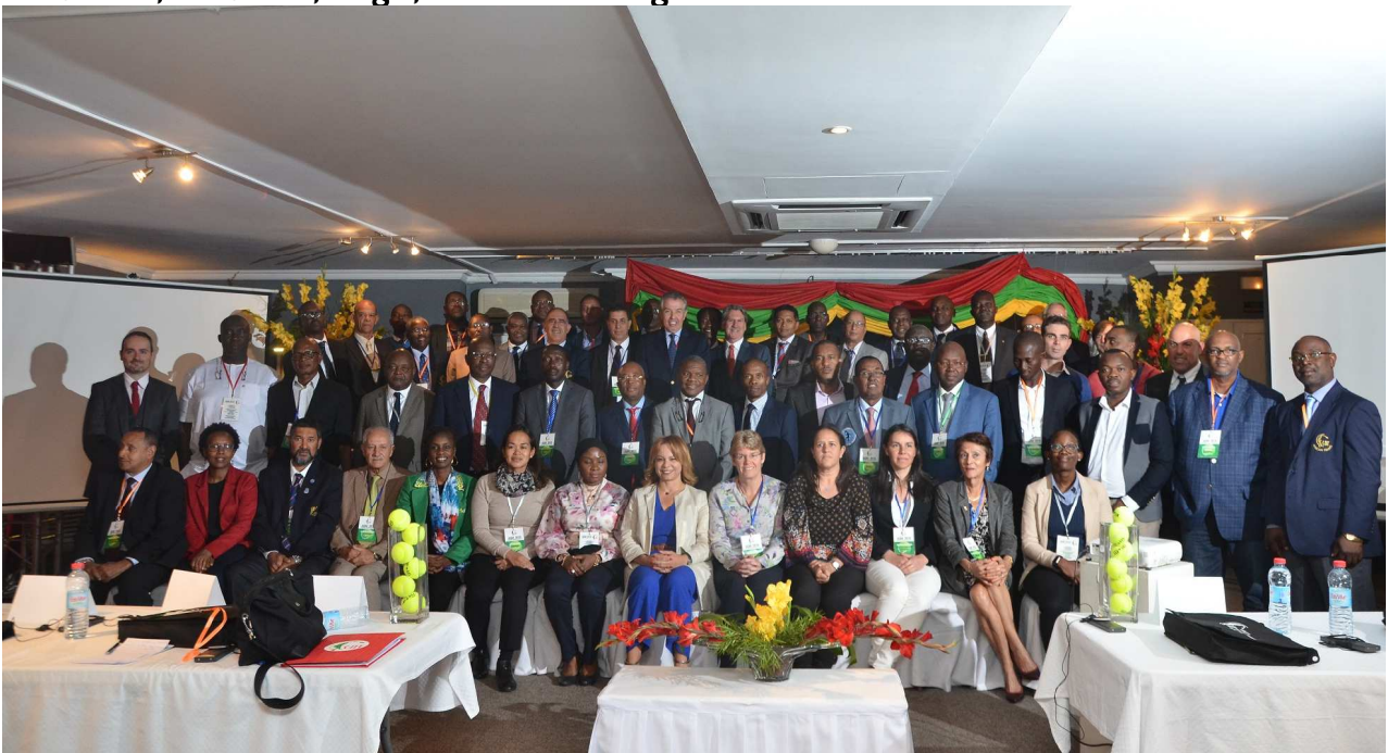
Family Picture with all participants at the CAT AGM 2019

The Confederation of African Tennis (CAT) organized in conjunction with Malagasy Tennis Federation its Annual General Meeting (AGM) on 15 th June 2019 at Colbert Hotel in Antananarivo with the participation of more than fifty Presidents and delegates from CAT African Federations Members representing 31 countries: Algeria, Angola, Benin, Botswana, Burundi, Comoros, Congo Brazzaville, Democratic Republic of Congo, Equatorial Guinea, Eritrea, Ethiopia, Gabon, Ghana, Guinea Conakry, Kenya, Madagascar, Mali, Mauritius, Mauritania, Mozambique, Nigeria, Rwanda, Senegal, Seychelles, Somalia, South Africa, Swaziland, Tanzania, Togo, Tunisia and Uganda.