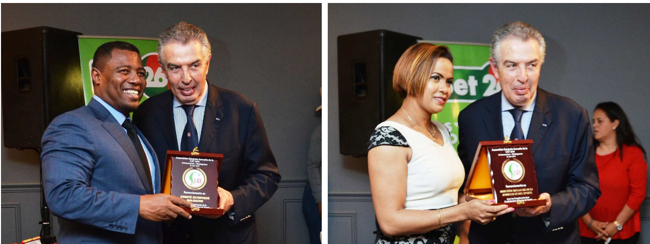
The President of the National Malagasy Olympic Committee and the Representative of the Ministry of Sport in Madagascar honoured by the CAT President