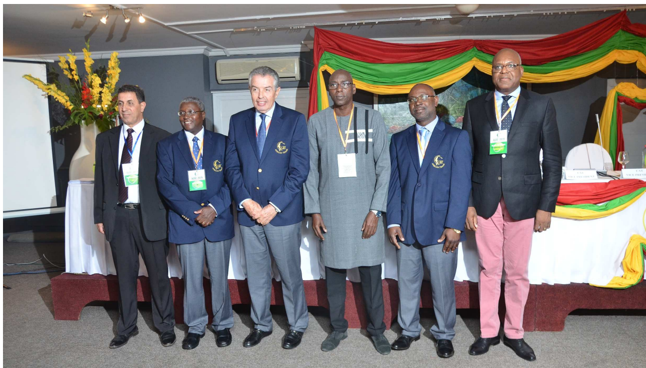
The new CAT Executive Committee