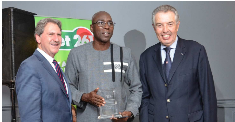
Mr Issa Mboup, President of Senegal Tennis Federation receiving the ITF Award of Zone II in recognition of the progress made in promoting tennis

Zone I - North Africa: Egypt ; Zone II - West Africa: Senegal ; Zone III - Central Africa: Congo ; Zone IV - East Africa: Uganda ; Zone V - Southern Africa: Zimbabwe