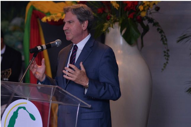
Mr David Haggerty – ITF President

Intervention of the Representatives of the Ministry of Sport & the National Olympic Committee of Madagascar The President and the ITF Officials also made a variety of interventions at this AGM, which took place as usual in a very friendly and fraternal atmosphere among all the delegates.